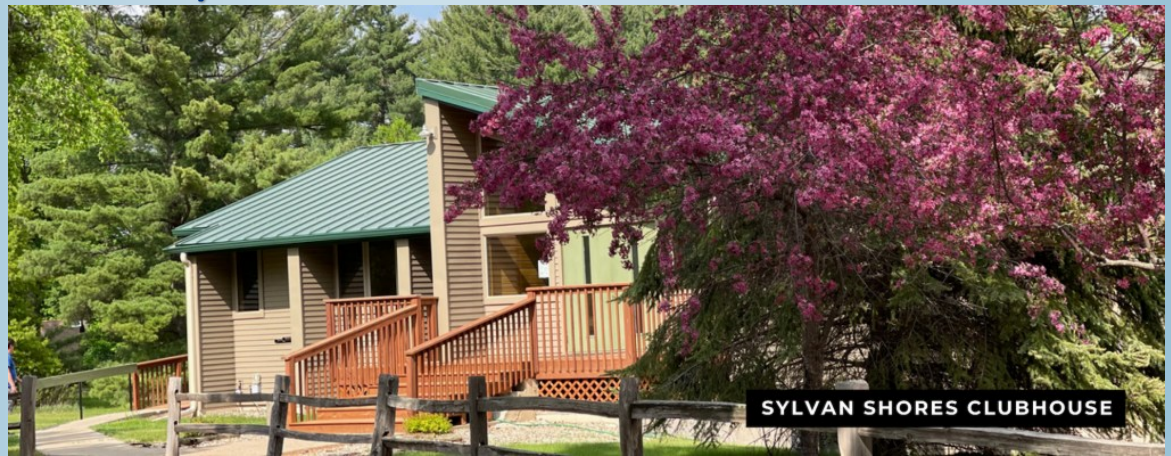
SYLVAN SHORES CLUBHOUSE